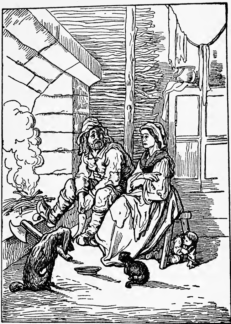
"SLIPPED UNDER HIS FATHER'S SEAT."